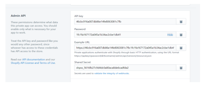
Figure 1 Shopify Code API