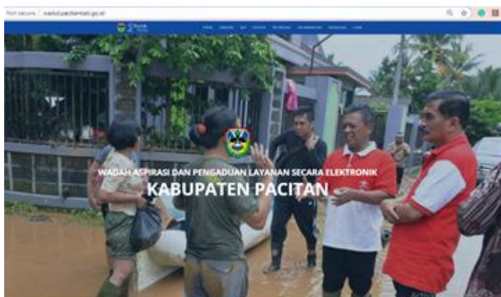
Figure-3. Wadul Website

1) Publications related to news and information about tsunami disasters using internet through website accounts released website by Public Relations with the address http://wadul.pacitankab.go.id/Wadule Pacitan (A Place for Aspirations and Complaints of Secar a Electronic Services) Pacitan Regency as a medium the aspirations and complaints of the electronic service community which in this case is related to the tsunami disaster. The most important point that should be understood that the program wadule in essence a common application that channels the aspirations and public services, with no exception communication tsunami disaster that occurred in 2017.