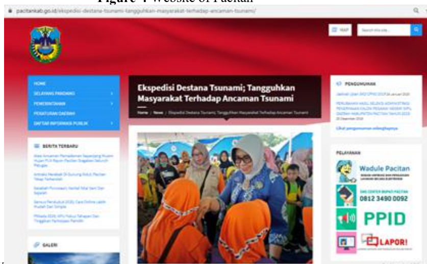
Figure-4 Website of Pacitan